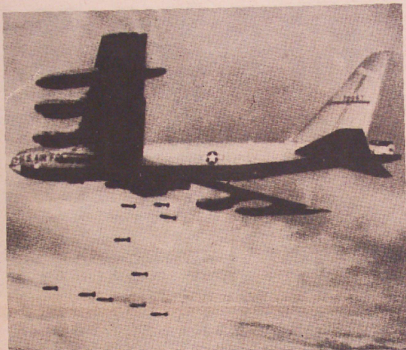
The Saigon puppet army, like the U.S. army before it, relies mainly on artillery and air power, not on political popularity.