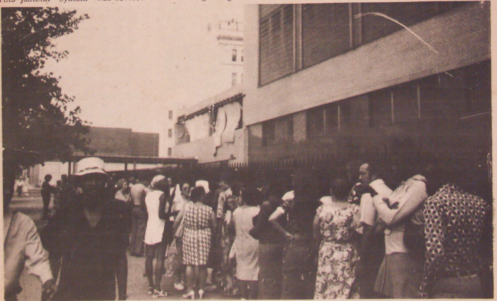
The Brooklyn House of Detention authorities have "clamped down" on the right of prisoners' lawyers, friends and families to visit them, in an effort to halt the inmates' successful boycott.