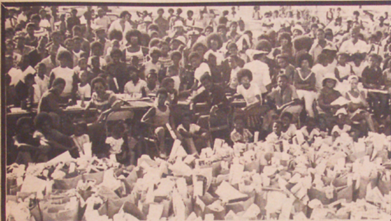
Four thousand Black people in Houston, Texas came out on July 26th to participate in the Black Panther Party's Survival Program.

BLACK PANTHER PARTY SURVIVAL PROGRAMS BUILDING ALL OVER THE COUNTRY.