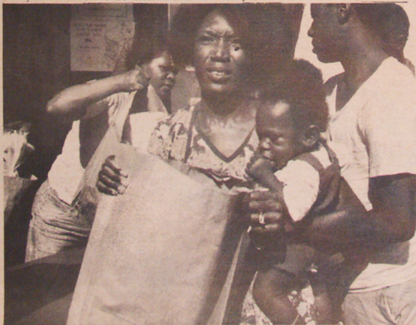
PHILADELPHIA: Hundreds received free food and shoes in the FREE FOOD FOR SURVIVAL RALLY.

something to tide us over until complete liberation. If these programs were the final goal, they could be called reformist; if they will bring us all closer and raise that united consciousness to struggle to the point of liberation they will be revolutionary.