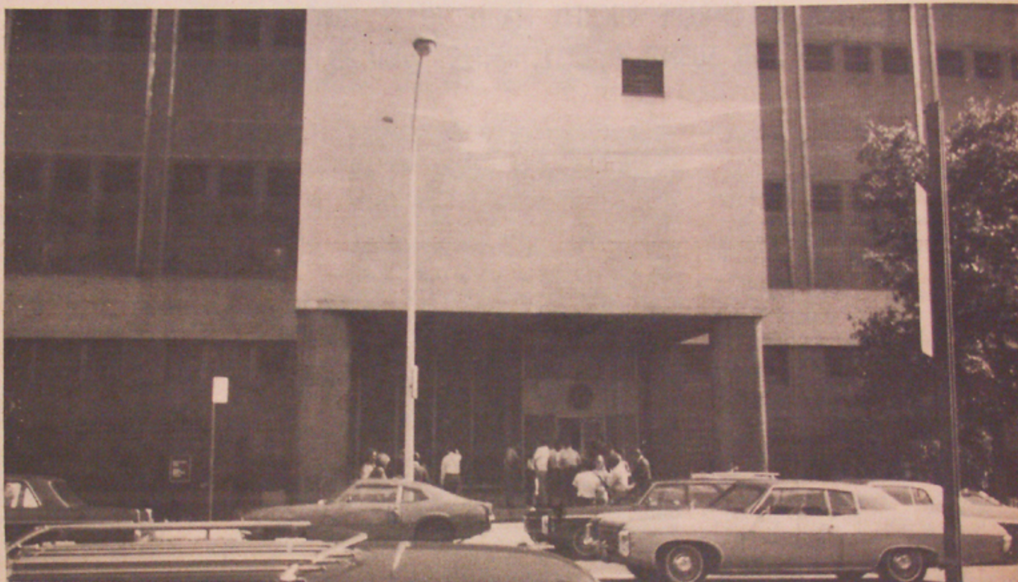
The Brothers have vowed to continue their refusal to go to trial until the necessary steps are taken by the Brooklyn House of Detention authorities that will end the oppressive conditions there.

INMATES OF BROOKLYN HOUSE OF DETENTION BOYCOTT RACIST NEW YORK JUDICIAL SYSTEM.