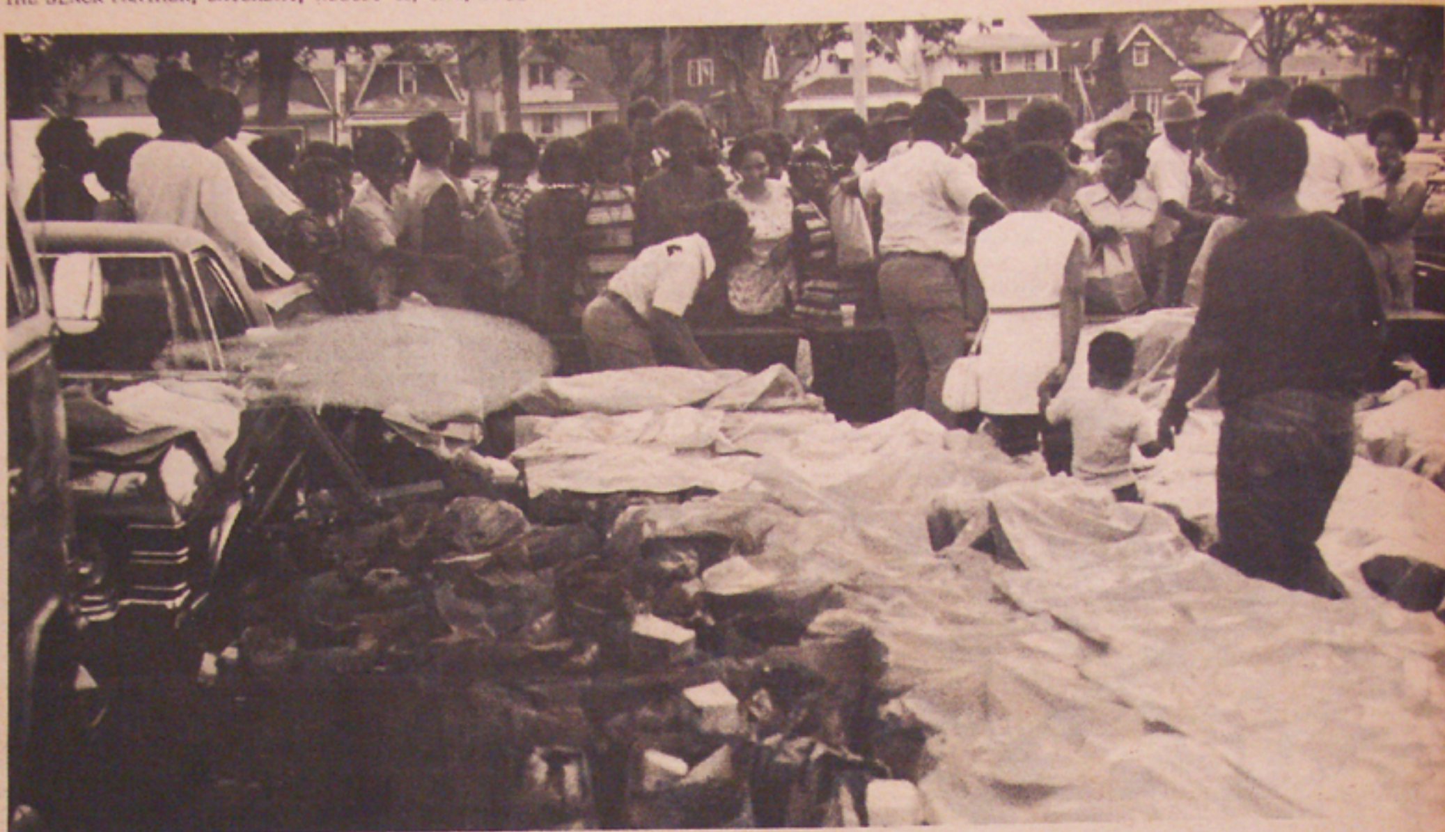
TOLEDO: Six thousand Black people came out to participate in COMMUNITY DAY FOR JUSTICE.